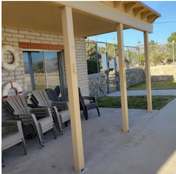
Repaired patio support beams