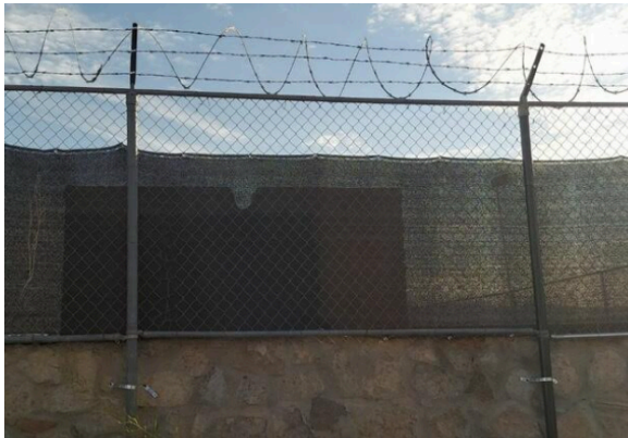
The repaired fence on Girl Scout Lane

The board approved the repairs to fence along Girl Scout Lane and the patio at the rear of the clubhouse.